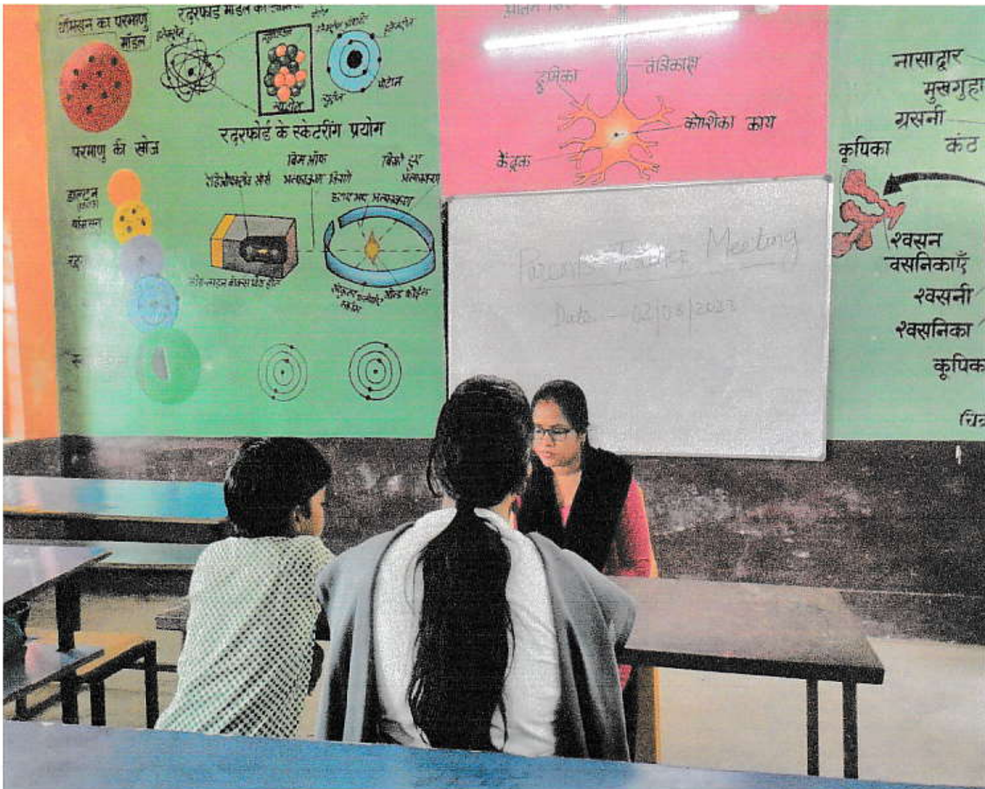
Parents Teacher Meeting during Internship Date : 02/08/2023