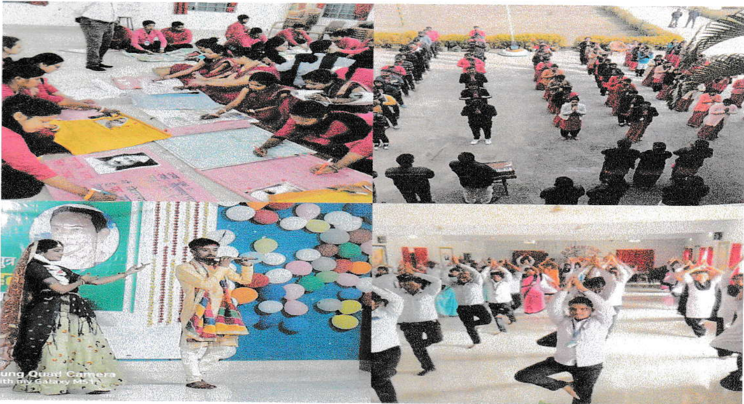
Collaborative Task (June 23, Sep 22)