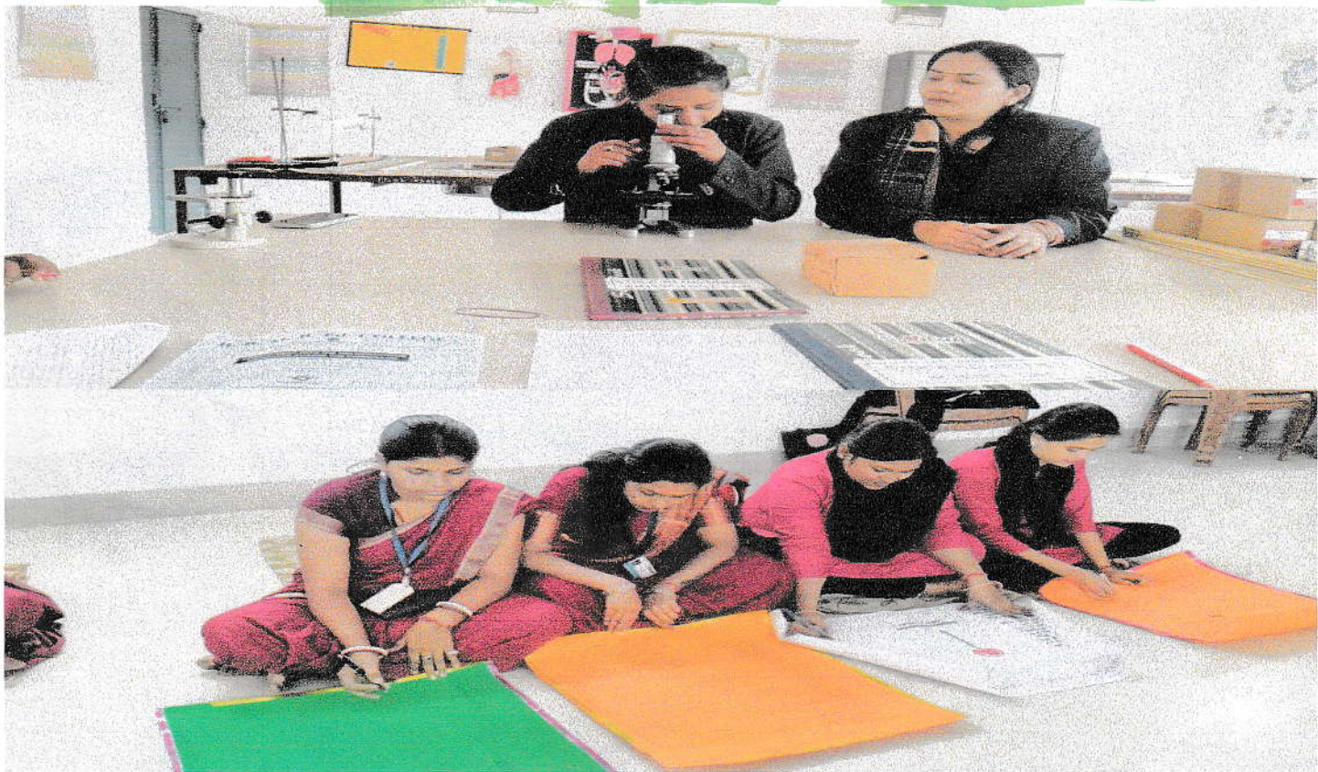
Learning Enhancement / Enrichment Inputs (10/08/22 to 13/08/22)