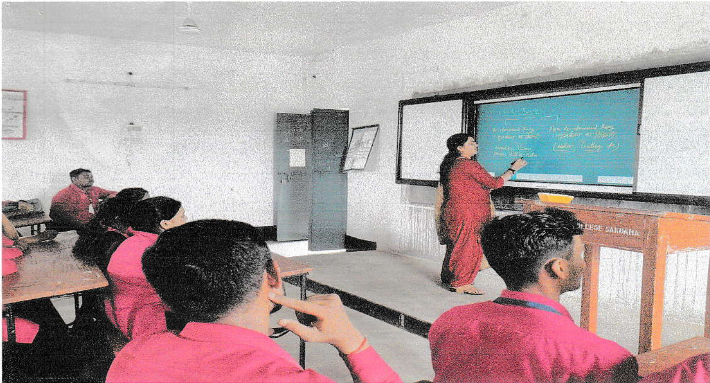
Remedial Teaching by Teacher Educator