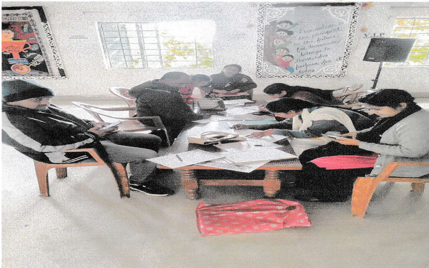
Peer feedback (Throughout Semester) 2023