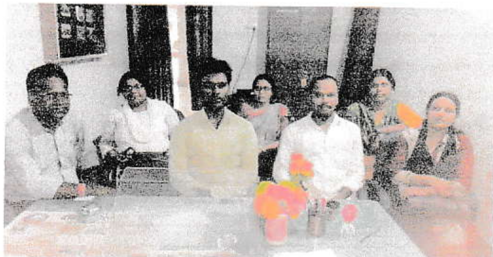
Teacher Orientation Programme

A teacher orientation programme was conducted on 16-08-2018. In this programme it was discussed on syllabus and curriculum, objectives of B.Ed. programme (PLO/CLO), nature and scope, certificate course of B.Ed. programme before student induction programme at Principal room. All the teacher participated actively in this programme.