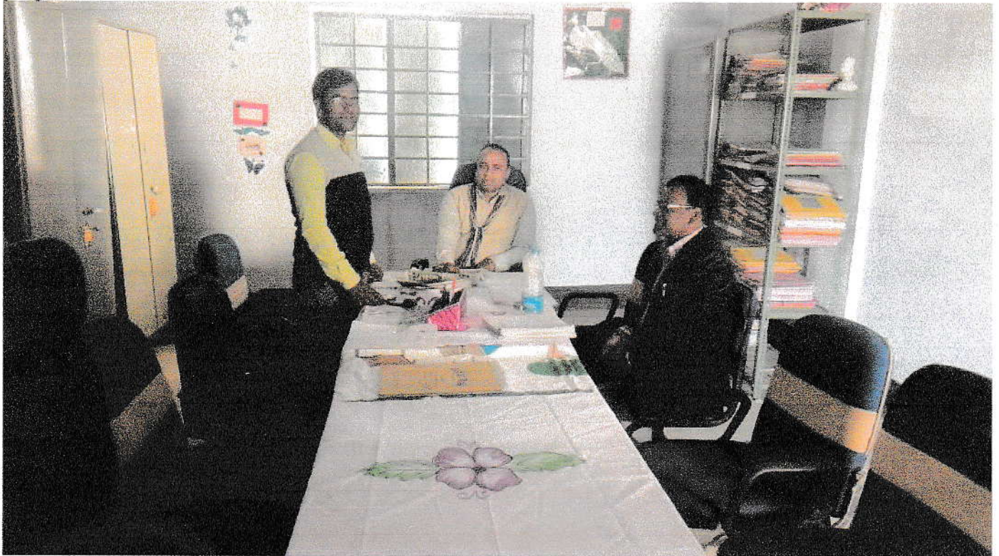
Teacher Orientation Programme (16-08-2018)

A Teacher Orientation Programme was conducted on 16-08-2018 & 01-02-2019 for B.Ed. Session 2018-20. In this programme, different types of matter was discussed like- History and background of B.Ed. Course, Objectives of B.Ed. Programmes (PLO, CLO) Nature and Scope of B.Ed. programme, Curriculum of B.Ed. House Division etc All the teachers of B.Ed. Section were present in this programme. Overall the programme was successful.