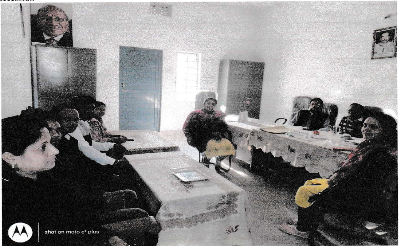
Teacher Orientation Programme (07-04-2022)

A Teacher Orientation Programme was conducted on 07-04-2022 for B.Ed. Session 2020-22. In this programme, different types of matter was discussed like- History and background of B.Ed. Course, Objectives of B.Ed. Programmes (PLO, CLO) Nature and Scope of B.Ed. programme, Curriculum of B.Ed. House Division etc All the teachers of B.Ed. Section were present in this programme. Overall the programme was successful.