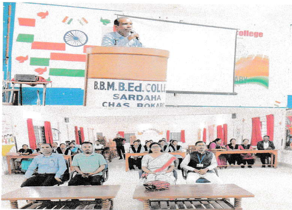
Seminar on India's Freedom Struggle

On account of Azadi ka Amrit Mahotsav, Our Institution B.B.M B.Ed. college Sardaha, Chas, Bokaro organized a seminar on the topic "India's Freedom Struggle" on 2/11/2021 which aimed to bring alive stories of unsung heroes whose sacrifices have made freedom a reality for us and also revisits the milestones, freedom movements. The significance of this glorious celebration is significantly related to instilling feeling of patriotism and nationalism in pupil-teacher. All the Pupil-Teacher and faculty were actively participated and the programme was successful accomplished.