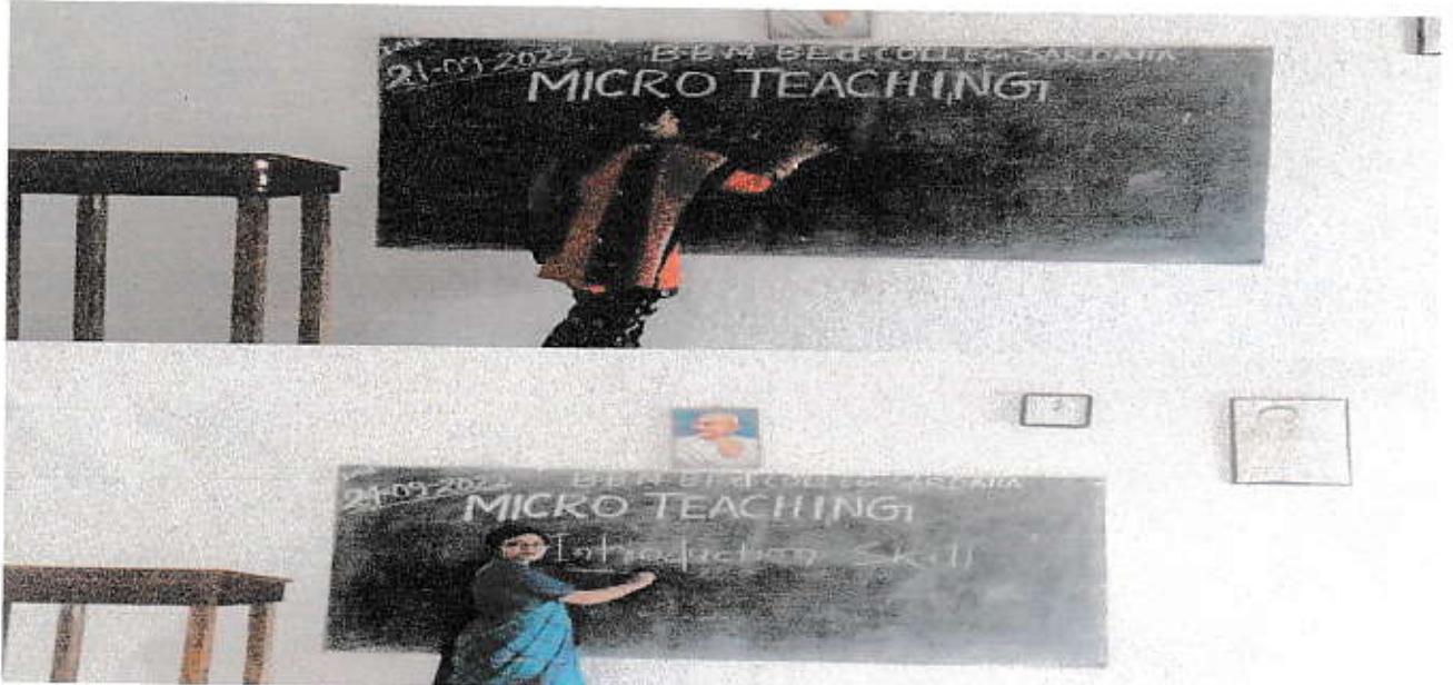
Micro Teaching Classes