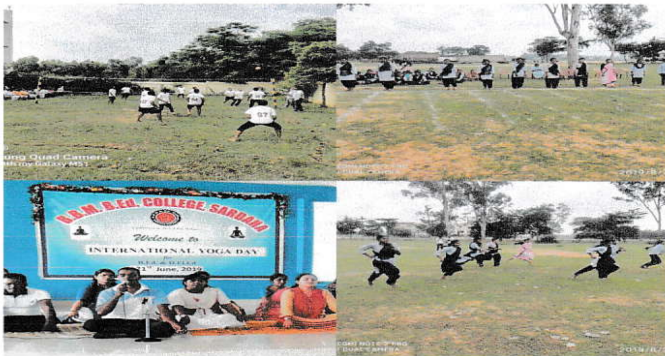
Participation in Sports and Yoga