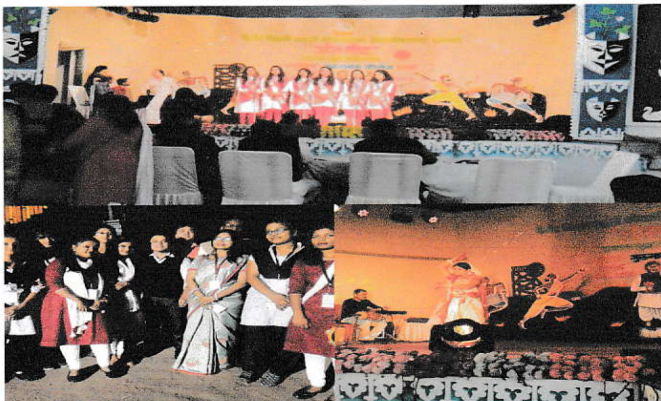
Participant in Youth Festival

Principal B. B. M. B.Ed College Sardaha, Chas, Bokaro