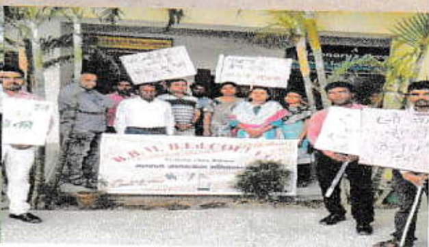
Participation in Awareness Programme