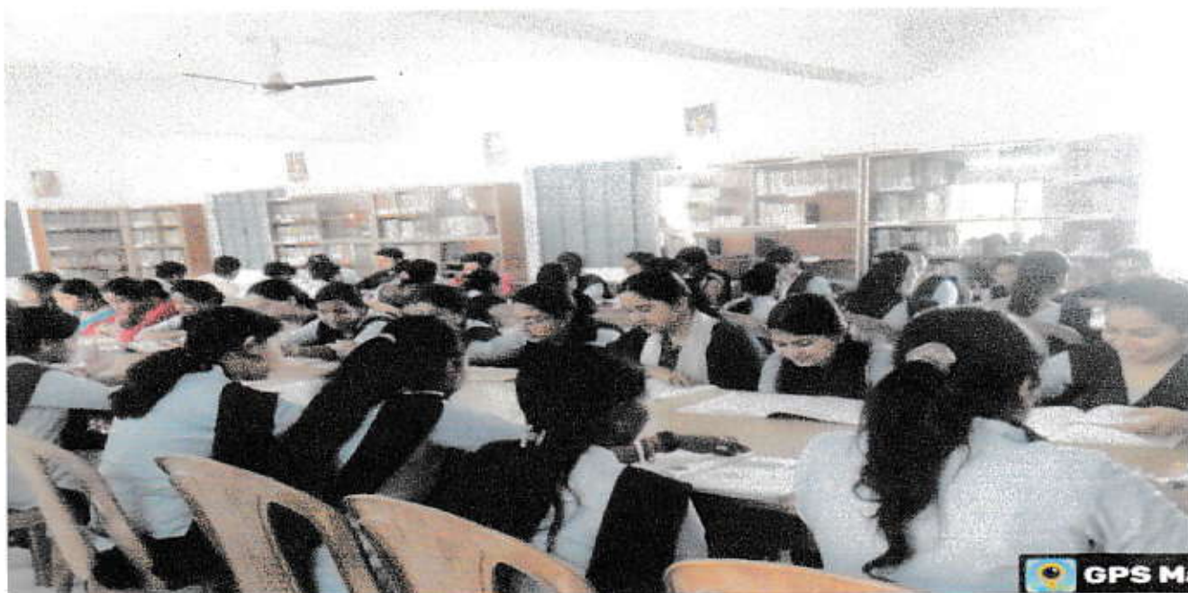
Book Reading Activities